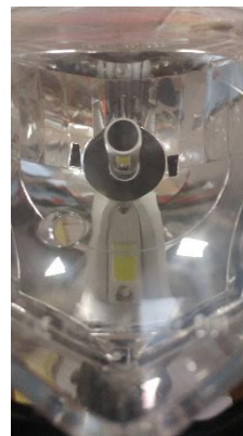
Bottom of reflector

The point of the triangle should be facing up with 2 emitters visible. The flat of the triangle will face down with one emitter visible.