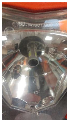
Top of reflector

The point of the triangle should be facing up with 2 emitters visible. The flat of the triangle will face down with one emitter visible.